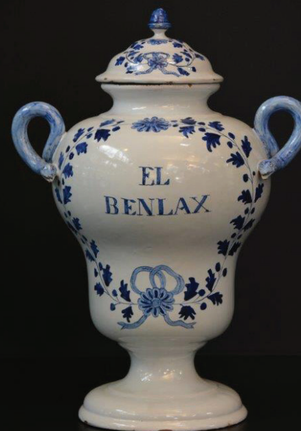
MedPhoto&Graphics Auckland DHB | FEB 2020 | MP1573