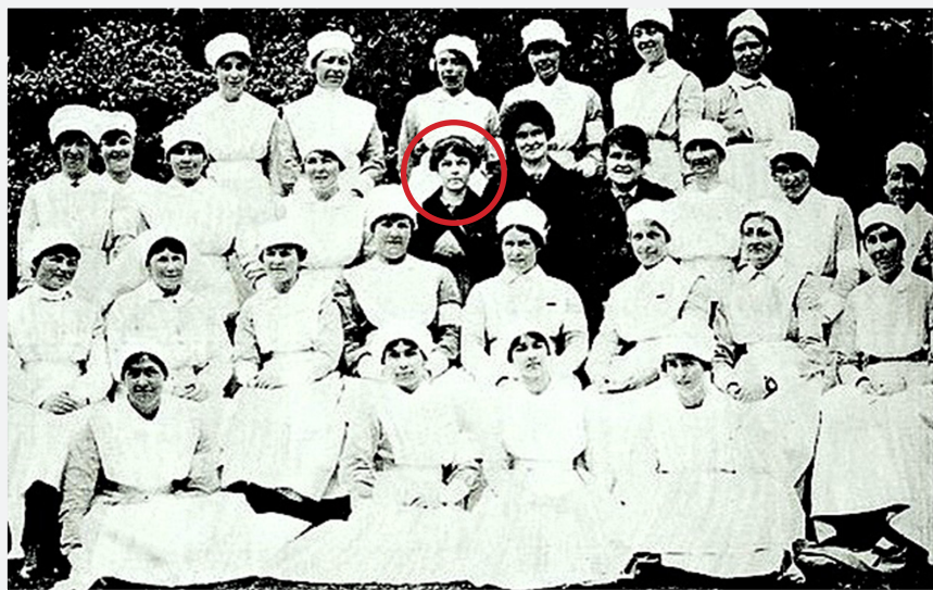
Volunteer Ambulance Division at the No 2 New Zealand General Hospital at Walton-on-Thames, England