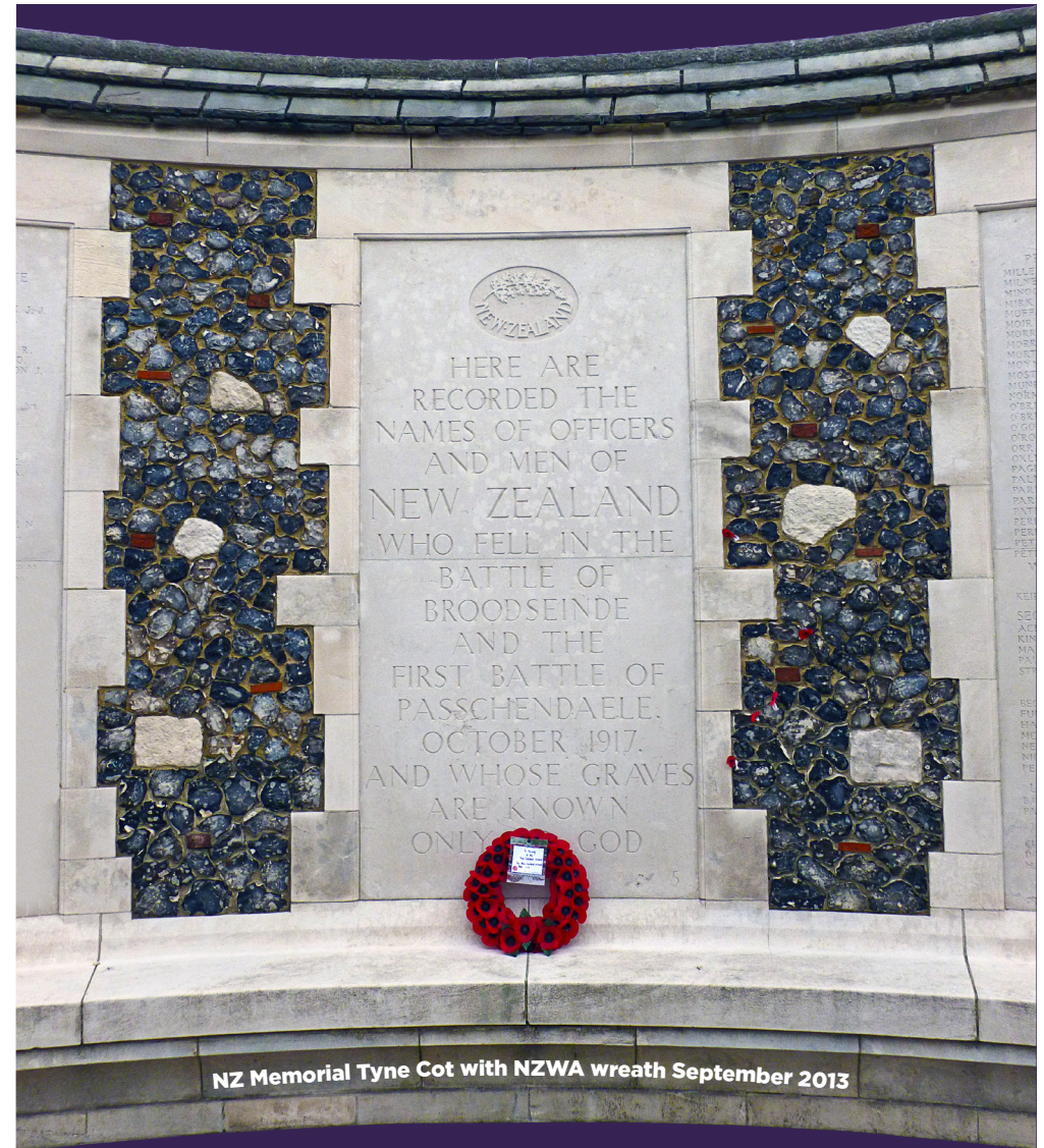
NZ Memorial Tyne Cot with NZWA wreath September 2013

Major operations began for the New Zealanders on the Western Front in Belgium with the capture of Messines (Mesen) Ridge in June 1917. The Battle of Passchendaele took place between July and November 1917 for control of the ridges south of Ypres. The NZ Division fought in the Battle of Broodseinde on 4 th October 1917 and the second attack on the 12 th October at Passchendaele. By the time they withdrew there were 18,000 casualties and 5,000 deaths with 845 in one day. Three Victoria Crosses were awarded to New Zealanders for bravery. Many soldiers are buried at the Tyne Cot Military Cemetery, the largest Commonwealth War Graves cemetery in the world. The rear wall bears the names of 35,000 British and New Zealand soldiers whose bodies were not recovered. There is also a New Zealand Memorial at Messines commemorating 800 New Zealand soldiers with no known grave.